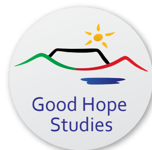
Table Mountain Residence